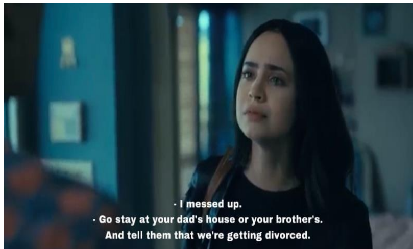
Figure 5. Cassie told Luke to get out of her apartment

Cassie : Go stay at your dad's or your brother's. And tell them that we're getting divorced.