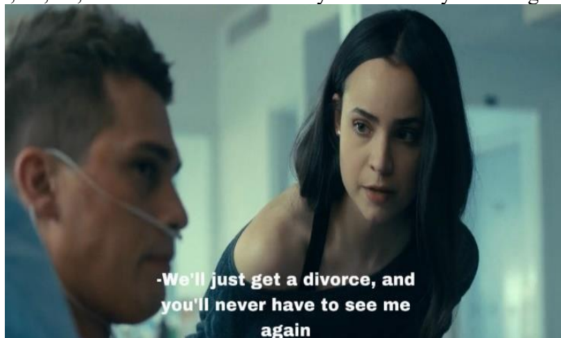
Figure 2. Cassie asks a divorce from Luke

Luke : No, no, no, he doesn’t trust me already. He’s already watching us.