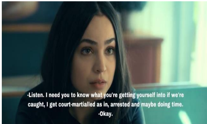
Figure 1. Cassie rejects Luke’s offer of marriage Source: https://www.netflix.com/id/title/81043665?source=35

At first, Cassie refuses Luke’s invitation to marry because Luke says, “Marriage should be for love. Moreover, where I come from. It’s for life.” Cassie thought if Luke wanted to ask her to marry, but the offer was rejected by her, and asked for other options. However, Cassie thinks that Luke can be trusted, and she wants to pretend to marry her to get medical facilities.