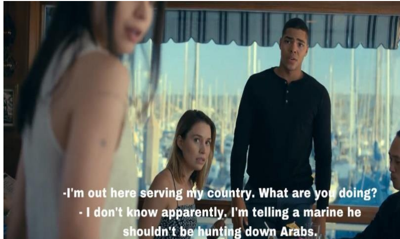
Figure 6. Cassie argues with Armando