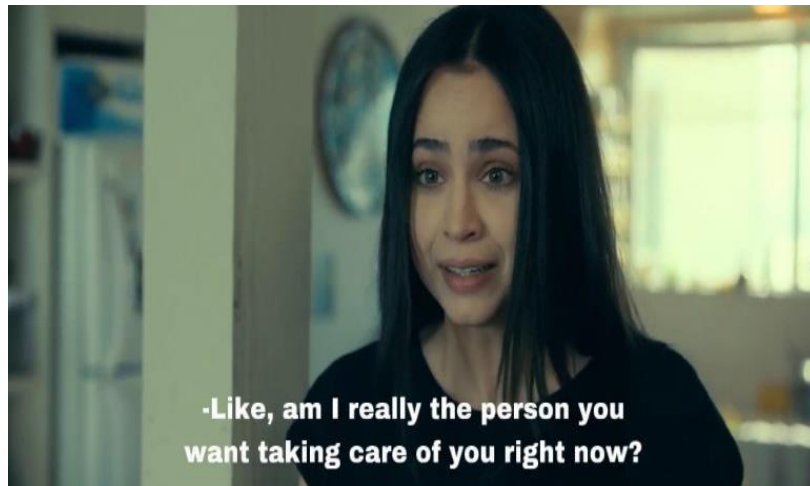
Figure 3. Cassie refuses to take care of Luke in her apartment

Luke : No, no, no. You are not taking care of me. Please don't.