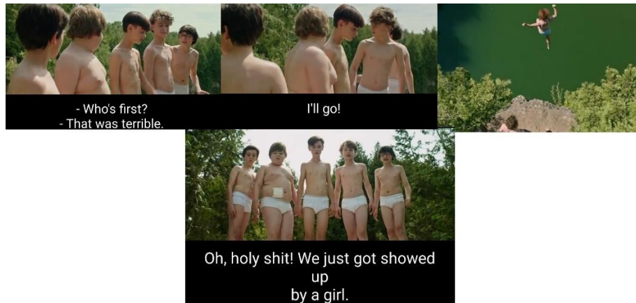
Figure 1. The screenshot of Beverly jumping into the quarry

The conversation takes place while Bill, Eddie, Richie, and Ben are on summer vacation and planning to swim to the quarry. Arriving at the quarry, none of them dared to jump first from the cliff into it. Suddenly, Beverly came and jumped first. The conversation is presented as follows.