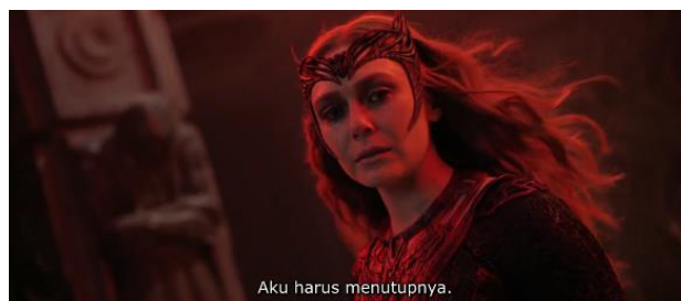
Figure 7. Wanda realized her mistake

This one is the last part of the movie. Here, she talks to another Dr. Strange from different universe. She has lost his battle with Dr. Strange and the girl called America because America can control her power right now. The conversation made by Wand can be seen below.