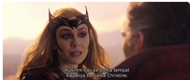
Figure 5. Wanda did negotiation to Dr. Strange

In this scene, Wanda tries to negotiate with Dr. Strange; if he gives her the girl, she will send him to another universe where he can stay with her love Christine. In this universe, Christine got married to other boys, and Dr. Strange felt hurt by that. But Dr. Strange didn't agree with that negotiation and chose to save the girl. The conversation between them can be seen below.