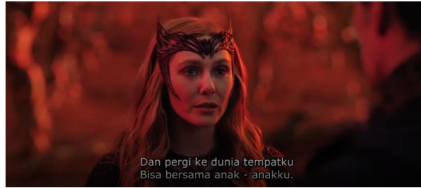
Figure 3. Dr Strange comes over Wanda for asking help

Dr. Strange : What do you want with the Multiverse? Wanda : I'm going to leave this reality and go to one where I can be with my children