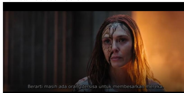
Figure 1. Reed is talking to Wanda

This scene tells about the situation when Wanda from Earth-616 went to Earth-838 to possess Wanda from Earth-838 and invaded the Illuminati. In this organization, Earth's strongest heroes are gathered in one place which consists of Reed Richard, a.k.a Mr. Fantastic, Professor Charles Xavier a.k.a Professor X, Mordo, Captain Marvel, Peggy Carter a.k.a Captain America and Black Bolt. Then, a conversation between Reed and Wanda happens, which can be seen below.