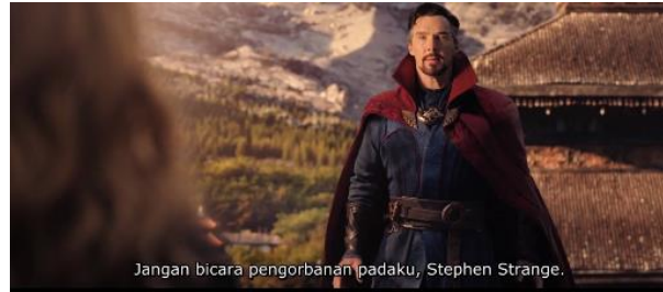
Figure 4. Wanda and Dr Strange were arguing

Wanda : Don't talk about sacrifice to me, Stephen Strange