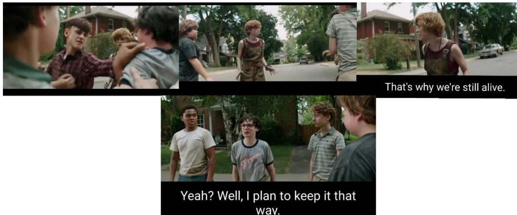
Figure 3. The screenshot of the scene of Beverly made them all realize that it was their togetherness that kept them safe from the well house

The conversation took place as they managed to get out of the wellhouse. After discovering the well that is Pennywise's hiding place, Bill wants them all to be better prepared to fight him next time. Richie and the others thought Bill had gone mad because Eddie had almost been killed and Ben had cut his stomach. Hearing that they are all divided, Beverly realizes that this clash is what Pennywise wants; Pennywise wants us all to be divided. We were together against Pennywise, and that is what keeps us alive. The conversation is presented as follows.