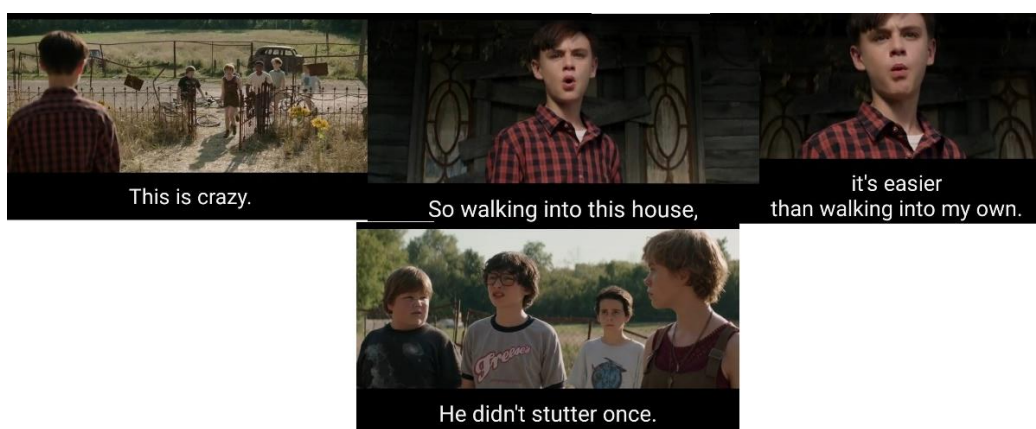
Figure 2. The screenshot of the scene of Bill wanting to enter the wellhouse to kill Pennywise

him. However, Bill wants to end all of this because he does not want any more missing cases caused by Pennywise. The conversation is presented as follows.