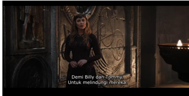
Figure 2. Wanda is activating the true Dark Hold

The scene was about Wanda activating the true Dark Hold by activating the pattern curved in the wall made by the first evil named Chrton, and Wanda activated it while talking to Wong, the Sorcerer Supreme in Earth-616 -616, which can be seen in the conversation below.