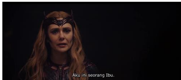
Figure 6. Wanda claimed herself

In this scene, Wanda enters Kamar-Taj and tries to find the girl. But in the middle of her way, she was confronted by Dr. Strange and Reer. They talked to each other, and Wanda tried to explain her feelings to her imaginary kids. Whatever she told Dr. Strange, it will not make him change his mind to save the girl. The conversation with Wanda can be seen below.