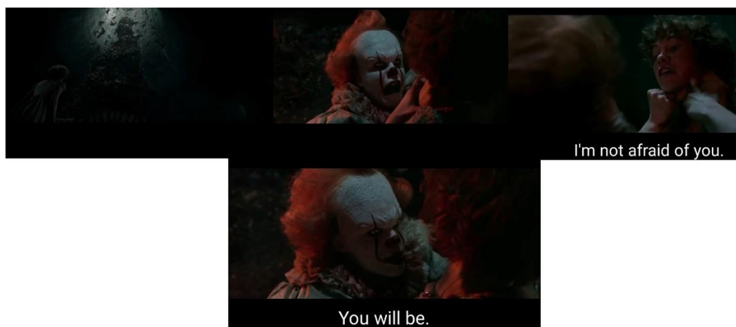
Figure 4. The screenshot of the scene of Beverly Caught by Pennywise and threatens to kill her. However, she is not afraid of Pennywise

The conversation takes place when Pennywise captures Beverly. When she awoke, Beverly was at the wellhouse. While trying to escape, Pennywise finds out and threatens to kill her if she dares to escape. Getting the threat, she still tried to escape by running towards another well channel but was eventually caught by Pennywise. When caught, Pennywise tries to scare her, but it does not work because she is not afraid of Pennywise. The conversation is presented as follows.