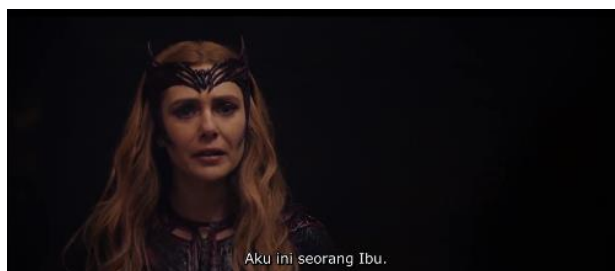
Figure 6. Wanda claimed herself

Wanda : I'm not a monster Stephen, I'm a mother Dr. Strange : Wanda, you have no children