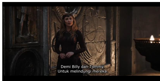
Figure 2. Wanda is activating the true Dark Hold

The scene was about Wanda activating the true Dark Hold by activating the pattern curved in the wall made by the first evil named Chrton, and Wanda activated it while talking to Wong, the Sorcerer Supreme in Earth-616 -616, which can be seen in the conversation below.