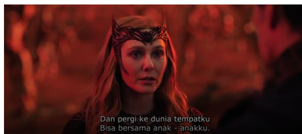
Figure 3. Dr Strange comes over Wanda for asking help

This scene is about Dr. Strange, who needs help from Wanda to protect Kamar Taj from evil and wants to kidnap America Chaves, who has the power to go to the multiverse. The conversation between Wanda and Dr. Strange can be seen below.