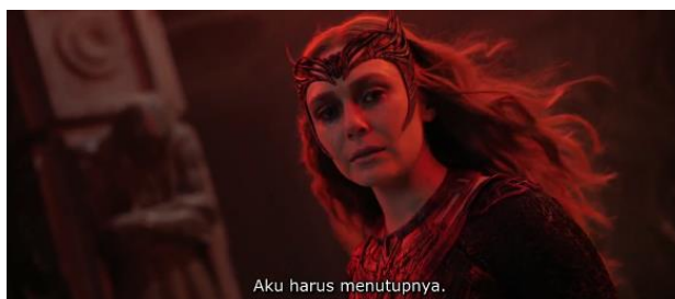
Figure 7. Wanda realized her mistake

This one is the last part of the movie. Here, she talks to another Dr. Strange from different universe. She has lost his battle with Dr. Strange and the girl called America because America can control her power right now. The conversation made by Wand can be seen below.