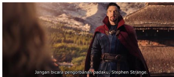
Figure 4. Wanda and Dr Strange were arguing

In this scene, Wanda comes to Kamar-Taj to go against America, a girl who has a superpower; she is needed. But when she arrived, there were so many squads guarding the Kamar-Taj, including Dr. Strange. Wanda and Dr. Strange talk to each other. She wanted him to give her the girl, but he didn't allow her, and it made her mad. The conversation can be seen below.