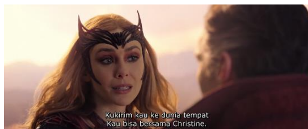
Figure 5. Wanda did negotiation to Dr. Strange

In this scene, Wanda tries to negotiate with Dr. Strange; if he gives her the girl, she will send him to another universe where he can stay with her love Christine. In this universe, Christine got married to other boys, and Dr. Strange felt hurt by that. But Dr. Strange didn't agree with that negotiation and chose to save the girl. The conversation between them can be seen below.